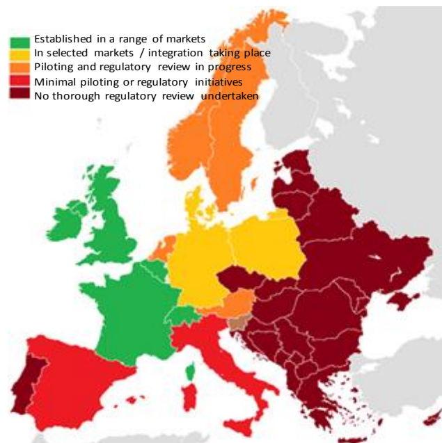
Figure 3 - Overview of progress of European countries relevant to deployment of demand response

Increasing generation from variable renewables requires an increase in power system flexibility to ensure current reliability standards are met. The increased flexibility requirements may trigger investment in a set of smart technologies, which may ultimately allow decreasing the costs of intermittency. This may be achieved by shifting the current focus on the provision of electricity to a focus on the provision of services.